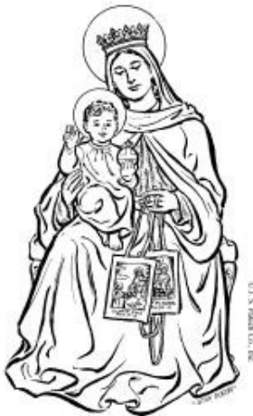
Our Lady of Mount Carmel Pray for Us